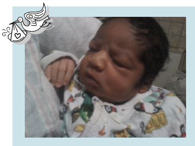
A new addition to the Guadalupe Partner family

To support Guadalupe Partners with a tax-deductible donation: